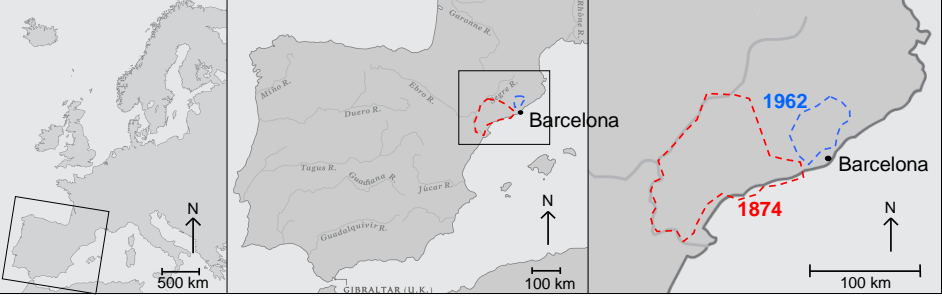
Figure 1. Areas affected by 1874 (in red) and 1962 (in blue) floods. Own elaboration on maps by the National Geographic Society, Washington D.C, Copyright (c) 2009