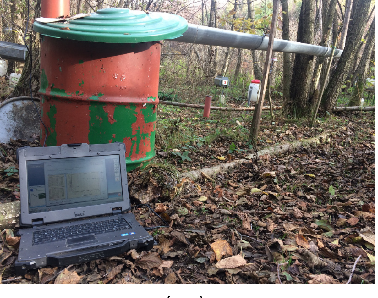
Figure 3: Automated measurements overview (a) a throughfall measurement trough (b) This gauge works with a expensive commercial data logger which will be used for validation purposes in the current development.

The rapid development of digital sensing technology enables to use of automatic data collectors to explore patterns in water income of agroforestry field. Because of the high number of the planned sampling points we try to find low-cost solutions. As a first step into the digital world, we installed new equipment in our riparian alder plot (Fig. 3).