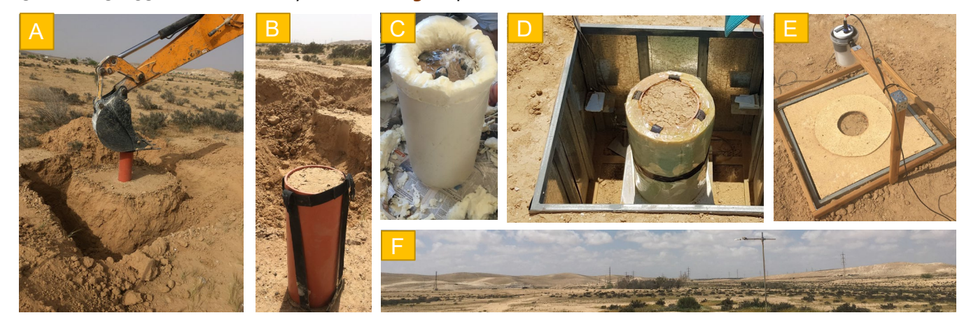
Fig. 1. Microlysimeters were 50 cm long <u>undisturbed</u> soil columns; excavated (A), sealed (B), insulated (C), and placed on an automated balance (D), flush with the soil surface (E) at the research site (F).

Measurements were conducted over the summer of 2019 at Wadi Mashash Experimental Farm (31°08'N, 34°53'E). Four microlysimeters (Fig. 1) provided direct measurements of NRWIs.