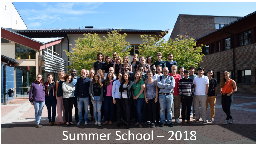
Summer School – 2018

CNDS has also contributed to the international educational curricula of natural hazards and disaster research through its international research summer school for doctorate students, which have been co-funded by EGU