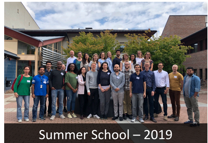
Summer School – 2019