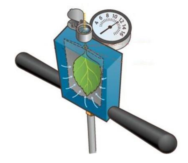
Stem water potential by a pump-up pressure chamber (PMS Instruments, USA)

Monitoring activities ( June-September 2019)