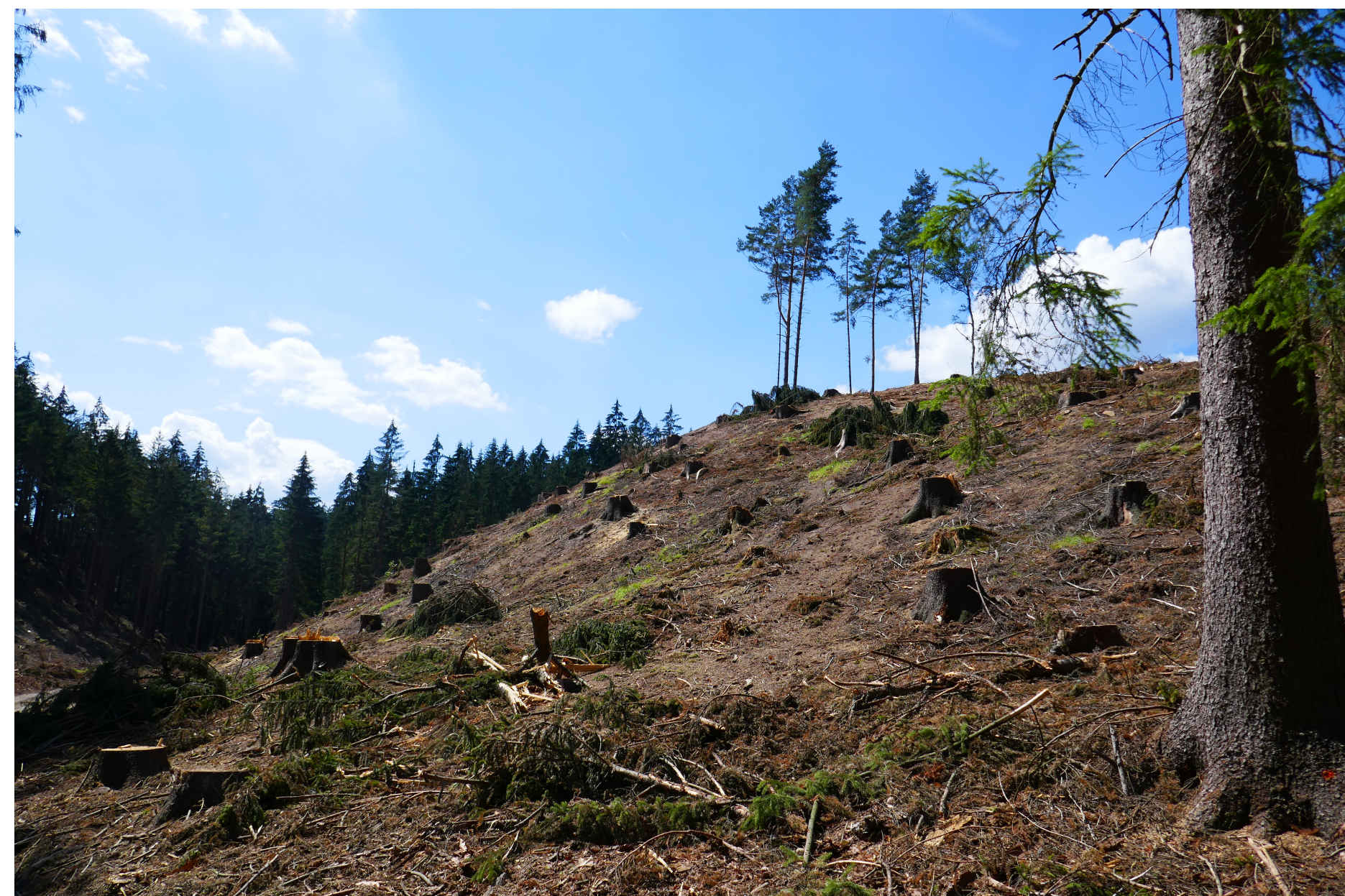
Figure 1: Impact of bark beetle outbreaks in the Czech forest areas

The central Europe experienced loss in forest areas due to the bark beetle outbreaks [2]. These zones are characterized mainly by the dense density of Norway spruce species. Recent evidence suggests that the accelerated bark beetle spread was driven by the drought and high level of proportion share of Norway spruce factors. Decision makers and forest practitioners have to take the necessary measures to avoid future tree damages. Managing forest stands involved applying several steps in BBN.