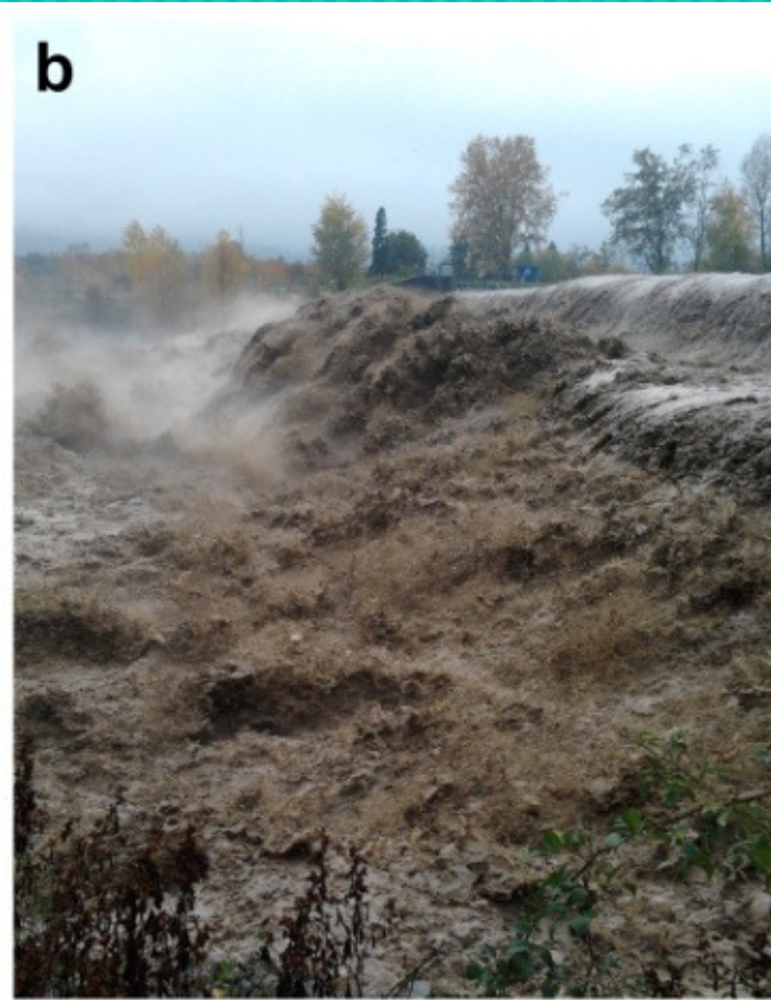
The embankment of Ponte Muratori and changes in flow rate of Panaro River: a) during low discharge and b) during a flood.

PLS _ PIANO LAUREE SCIENTIFICHE The "Geoframe Project" of the Modena-Reggio Emilia University, is a teacher professional development program originated from the collaboration between faculty members from the Department of Chemical and Geological Science (University of Modena and Reggio Emilia) and a group of teachers from different secondary school (2nd level) in the Modena province. Its main goal is to provide high school science teachers with an efficient tool of professional development that meets actual teaching needs but also provides the latest updates in the field of Geosciences.