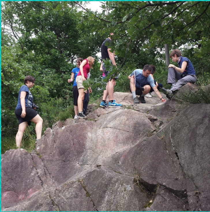
Field activities at the geo DIDALab in the Ivrea municipality, geoSITLab (Geomorphology, Geomatics and GIS Laboratory), University of Turin.