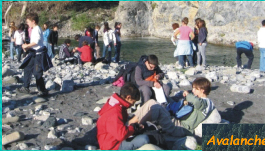
Fieldtrip organized by University of Milan and Pavia WG in collaboration with a secondary school of 1st level along Trebbia River, and in Solda Valley