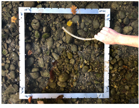
Figure 2: Frame and tube for the application of the Finstad method

The results are categorized into four different length classes. Based on the number of shelters available and the classes the shelter availability can be defined (tab. 1).