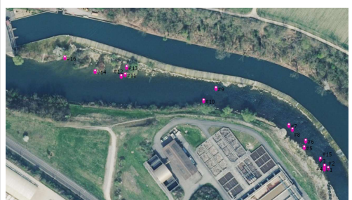
Figure 1: Sampling spots in the residual flow reach (the headrace channel can be seen in the upper part with the hydropowerplant in the left upper corner).