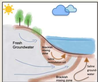
Fig. 2: Schematic of SGD, fig. modified after Bratton (2010).

An extrodinary storm event in early 2019 not only led to the partial flooding of an associated coastal peatland with brackish water but also pushed Baltic Sea water into the coastal aquifers allowing to investigate the time-dependent return to previous subterrestrial ,normal' conditions via SGD-induced freshening.