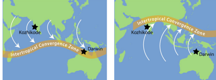
Figure 2: As the Intertropical Convergence Zone (ITCZ) changes location through the year, the winds, rains, and the location of wet monsoon weather changes, too. In this example from Asia and Australia, the ITCZ moves from the Southern Hemisphere (left map) to the Northern Hemisphere (right map).

However, this sensitivity to changing climate boundary conditions such as ice volume and greenhouse gas concentrations remain poorly understood across the Calabrian, in the Pleistocene Epoch.