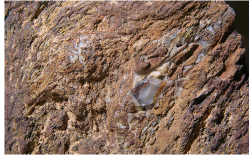
Close-up view showing the high quality color level of the detector together with the high spatial resolution allowing the view of filamentous biofabrics.