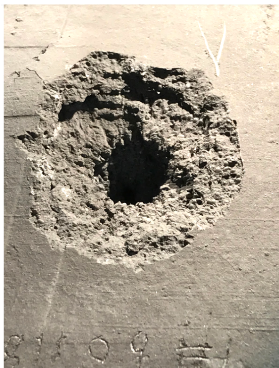
Figure 1: Impact crater on a CM2 asteroid analogue sample.

main instrument used here is a 2-stage light-gas gun (LGG), which can achieve speeds up to 7.5 km/s. Targets were the squared blocks of CM analogues with dimensions 9.5 cm x 9.5 cm and 4.4 cm thickness, while as projectile we used stainless steel of different diameters. In these experiments we measured the depth and diameter of the craters, the quality of the ejecta and the state of the inclusions. In particular we wanted to test a part of the hypothesis that on materials with inclusions, impacts produce mainly multiminerale fragments, whereas thermal cracking, as a slower process produces monomineralic.