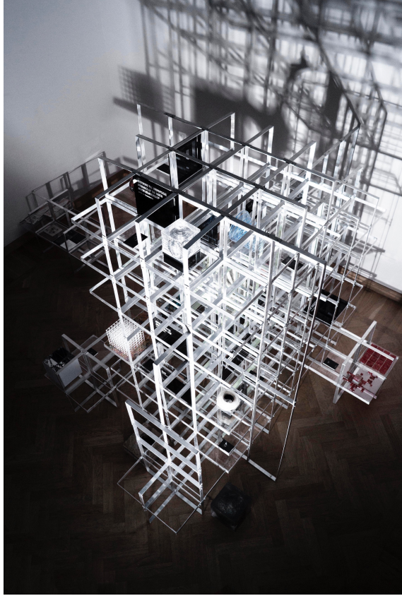
Fig. 2 Moon Gallery exhibition at Milan Design Week 2019 with BASE & Ventura Future