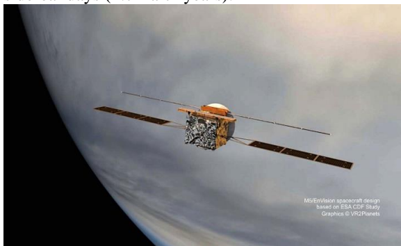
Figure 1: EnVision, following ESA CDF design.

EnVision [1,2] is a Venus orbiter mission that will determine the nature and current state of geological activity on Venus, and its relationship with the atmosphere, to understand how and why Venus and Earth evolved so differently. Envision is a finalist in ESA's M5 Space Science mission selection process, and is being developed in collaboration with NASA, with the sharing of responsibilities currently under assessment. It is currently in Phase A study; final mission selection is expected in June 2021. If selected, EnVision will launch by 2032 on an Ariane 6.2 into a six month cruise to Venus, followed by aerobraking, to achieve a near-circular polar orbit for a nominal science phase lasting at least 4 Venus sidereal days (2.7 Earth years).