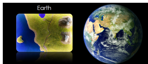
Figure 1: Comparison of Earth's model and an actual planetary image.

is presented in the figures below, where a sample of the constructed models are compared to the actual planetary images (Figures 1-3).