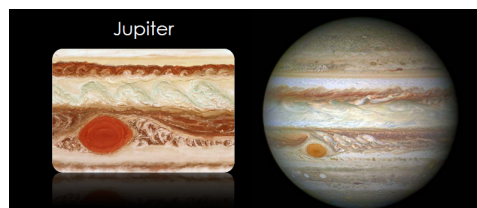
Figure 2: Comparison of Jupiter's model and an actual planetary image.