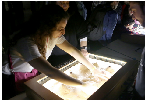
Figure 5: Visually impaired people touch the planets and feel the hot surface of Venus and its volcanic features.

The project is accompanied with social media accounts and a specially developed website, including all information about the Solar System and the exhibited planets. The developed website ( en.planetsinyourhand.phys.uoa.gr ) includes a brief description of the project, information about the exhibition and events, as well as information and details about the team members. All information is provided in both Greek and English language, while spe-