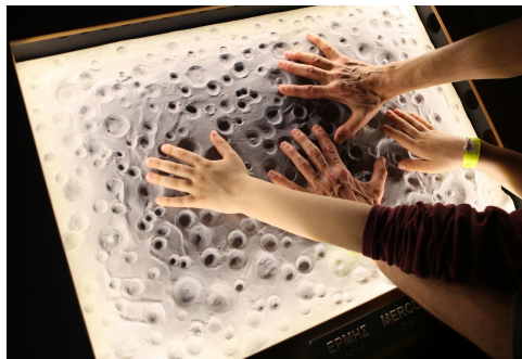
Figure 4: Visitors, while touching Mercury's surface.

On October 5, 2018, Planets In Your Hand exhibition was presented in the "Researcher's Night" at Demokritos NCSR Research Center with the model of Mars. People of all ages visited our exhibit and showed a great interest in our project. On October 7, 2018, the model of Mars was presented in the frame of "World Space Week 2018" event, organized at the University of Athens. Since 2019, the entire exhibition is completed and it has been on tour in the city of Athens. On March 31, 2019, the exhibition was presented to more than 700 visitors during a special day dedicated to Planetary Exploration at the University of Athens. The Planets In Your Hand team also participated in the Athens Science Festival between 4th-7th April 2019 with more than 1500 visitors. The visitors had the opportunity to see, learn and understand through the touch and vision the specificities of each planet (Figure 4). A particular emphasis on the visually impaired people was given (Figure 5) who showed enthusiasm and a great interest for Planets In Your Hand . In our next steps, the exhibition will be hosted by schools and educational institutions all over Greece.