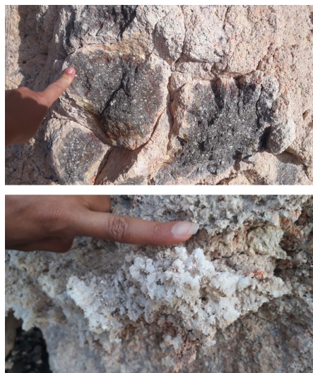
Fig. 1: Basalt blocks with strongly altered surface (top) that partly re-crystallized (bottom).

Sampled areas reach from classical basalt with dark and bright phenocrysts and dark glass to extensive ash deposits from different phases of the volcanic activity on the island. In addition, recently active fumaroles offered the measurements of numerous sulphur samples deposited onto the basalt surface. Of particular interest, however, was the alteration of the basaltic rocks due to the extreme environment with the lava directly deposited at the coastline and thus under influence of sea water and ongoing submarine volcanic activity. Figure 1 shows to close up views onto the lava deposits with major portions already strongly altered with particular crystal growth.