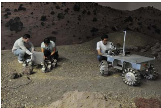
Fig. 1: Preparation of ExoGeoLab instruments tests of cooperative robotics