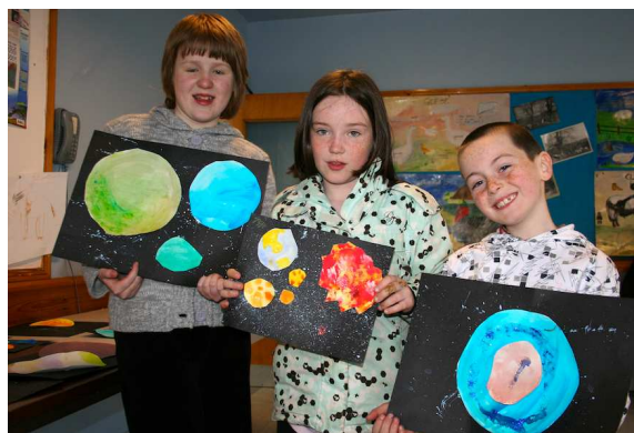
Figure 2: Artwork produced in a UNAWE project

The list of successful IYA activities is long. To mention just a few, they have included: the 100 Hours of Astronomy event, a notable highlight with all major amateur astronomy clubs, science centres and observatories participating; UNAWE art projects for young children (Fig. 2); From Earth to the Universe , an exhibition of some of the best astronomical images ever