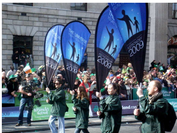
Figure 1: IYA in Dublin's St Patrick's Day parade

Ireland had the first event worldwide in the International Year of Astronomy with an immensely popular live web-cast of the rising sun from the 5,000 year-old burial chamber at Newgrange. Thereafter the official opening of IYA Ireland took place at the country's premier schools science event, namely the BT Young Scientist and Technology Exhibition at the Royal Dublin Society. The popularity rocketed even higher when St Patrick's Day parades in all major cities of Ireland endorsed an astronomy theme (Fig. 1).