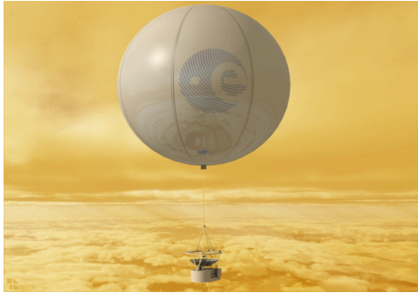
Fig. 2 : Artist view of the EVE balloon

climate, with relevance to terrestrial planets everywhere. It was proposed for the first time to the European Space Agency in 2007, as an M-class mission under the Cosmic Vision Program. Although it was not chosen for programmatic reasons, it was “seen by the SSWG as an attractive mission which was highly ranked scientifically”.