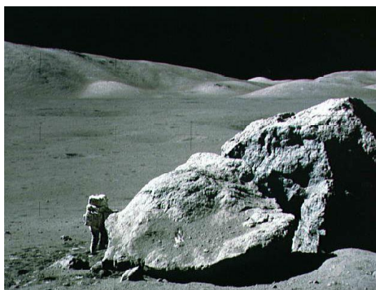
Figure 2: Apollo 17 astronaut Harrison Schmitt during his lunar field trip (NASA document).

This presentation details the successes and failures encountered.