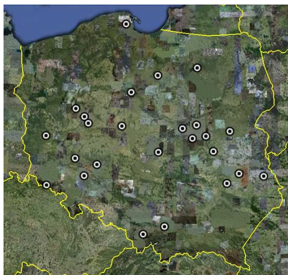
Figure 1: Positions of Polish Fireball Network video and photographic stations

The project also involved the Warsaw University Astronomical Observatory (OAUW), the Nicolaus Copernicus Astronomical Center (NCAC) and the Astronomical Institute at the University of Zielona Góra