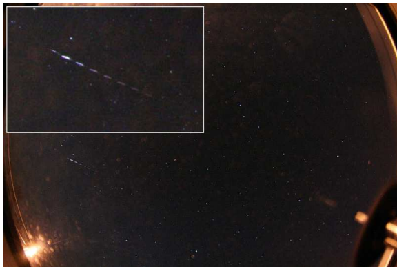
Figure 2: 2012.03.03 fireball captured by PAV47 video camera at station PFN42 and all sky photographic camera at station PFN43.