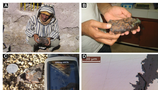
Figure 2. Meteorite fragments of Imilchil. A: Sample of more than 9 kg. B: Sample of more than 1.5 kg. C: Sample of 290 grams on site. D: Band of kamacite in a plessite matrix.

The samples found have a rusty appearance, with scales of alteration of several centimeters thick of oxides and iron hydroxide covering the entire outer surfaces thereof, indicating a long residence time in the soil. The polished surfaces don't show the Widmanstätten figures. The meteorite of Imilchil is an Ataxite rich in nickel, it consists mainly of iron mixed with 17, 3% nickel (X-ray fluorescence method in the department of Earth sciences, the University of Ferrara). The scanning electron microscopy revealed the presence of thin diffuse bands of kamacite (around 25 µm wide) in a matrix of plessite (Figure 2D) this texture is the evidence of structural deformation due to shock impact.