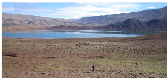
Figure 1. Panorama of the Isli Lake.

More than 183 structures of meteoritical impacts are highlighted on the Earth [1], including only three dual impact craters reported [2]. The impact craters of Isli and Tislit, 32°13'N, 05°33'W; 32°12'N, 05°38'W are respectively, located at 10 km and 4 km from the Imilchil village on the Central High Atlas in Morocco at respective altitudes of 2272 and 2266 meters. They are spaced apart from each other by 9.4 km. The origin and the date of formation of these two lakes are still unknown today. Surveys undertaken near them and in the surrounding areas leads to believe that they correspond to a dual meteoritical impact crater. We present here the discovery of this new dual impact crater in the Central High Atlas in Morocco. It is interesting, first by its young age, its perfect conservation and the geomorphology of the two depressions (Figures 1).