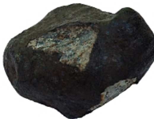
Figure 3. One of the specimens of the Chelyabinsk meteorite exhibited in the Virtual Museum.

virtual museum are the Dar Al Gani 400 lunar anorthosite and the North West Africa 6963 shergottite. This martian meteorite was found in 2011.