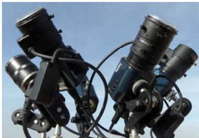
Figure 1. One of the new 6-video spectrographs arrays employed at the Cerro Negro mobile station.

appearing in meteor spectra. At this stage, the spectral resolution is also calculated. Most lines are produced by neutral Fe, but prominent lines produced by chemical species such as Mg, Ca and Na can also be very helpful for this calibration. Then, the spectrum is corrected by taking into consideration the spectral response of the spectrograph. Finally, the relative abundances are calculated, together with the temperature and the electronic density in the meteor plasma. An alternative analysis implies measuring the relative intensities of the contributions from Na I-1, Mg I-2 and Fe I-15 multiplets. These intensities provide information about the likely chondritic or achondritic nature of the progenitor meteoroids [8].