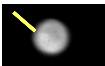
Figure 3: infrared ( >685\text{nm} ) image of Neptune taken on 2013.07.01 02h57UT