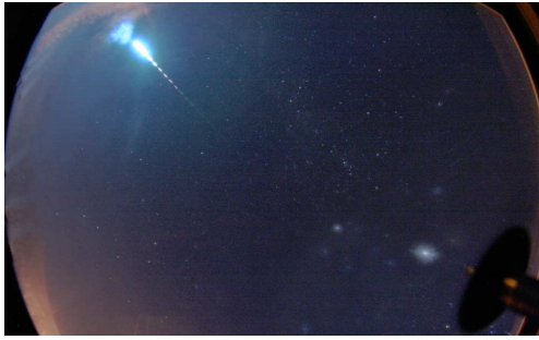
Figure 2: PF191012 Myszyńiec fireball captured by all sky photographic camera at station PFN43.

The project also involved the Warsaw University Astronomical Observatory (OAUW), the Nicolaus Copernicus Astronomical Center (NCAC) and the National Centre of Nuclear Research RC POLATOM