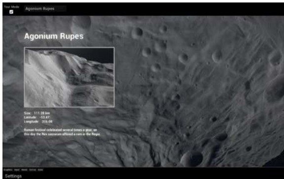
Figure 3: Vesta in Unreal Engine 4

Another project features Vesta. It allows free roaming around the asteroid as imaged by the Dawn spacecraft. There is also an integrated “Tour Mode” visiting prominent surface features and displaying additional information on-screen automatically in a loop (Fig. 3).