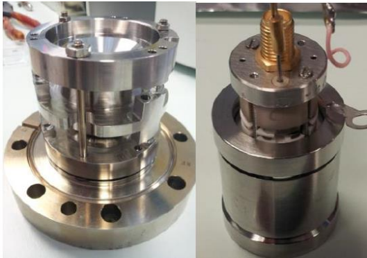
Figure 2: (left) High-speed (right) low-speed deployable Mass Spectrometer instruments