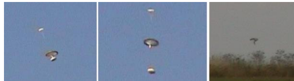
Figure 3: Screen shots from the video showing the MetNet Lander drop and inflation tests.

The eventual goal is to create a network of atmospheric observational posts around the Martian surface. Even if the MetNet mission is focused on the atmospheric science, the mission payload will also include additional kinds of geophysical instrumentation. The next step in the MetNet Precursor Mission is the demonstration of the technical robustness and scientific capabilities of the MetNet type of landing vehicle. Definition of the Precursor Mission and discussions on launch opportunities are currently under way. The baseline program development funding exists for the next five years. Flight unit manufacture of the payload bay takes about 18 months, and it will be commenced after the Precursor Mission has been defined.