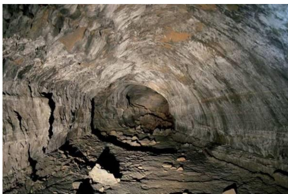
Figure 1: Inside Stefánshellir lava tube, West Iceland.

The project focuses on the development needed to establish facilities on the Moon and Mars, utilizing naturally occurring lava tubes which will serve as habitable zones for human exploration (figure 2). The cave will provide a development test site suitable for work with robots, materials, equipment and inflatable habitats with the aim of providing key data for future human missions to the Moon and Mars.