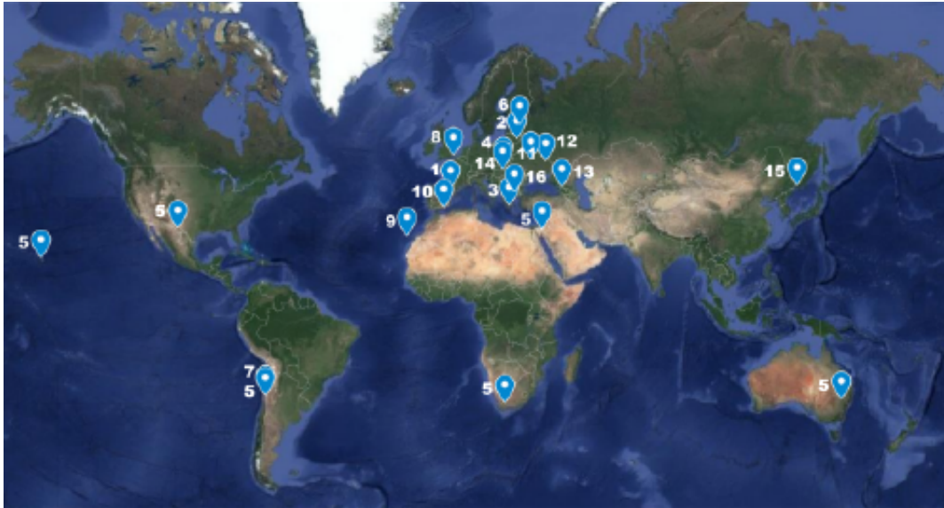
Fig. 1: The Europlanet Telescope Network (see also Section The Telescopes ).