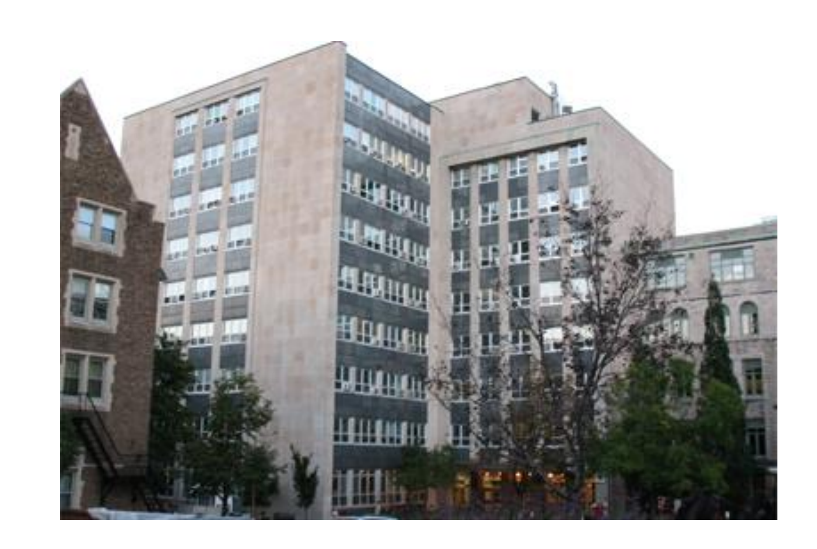
Image from <u>https://www.mcgill.ca/engineering/faculty-staff-</u> resources/facilities/buildings/mcconnell