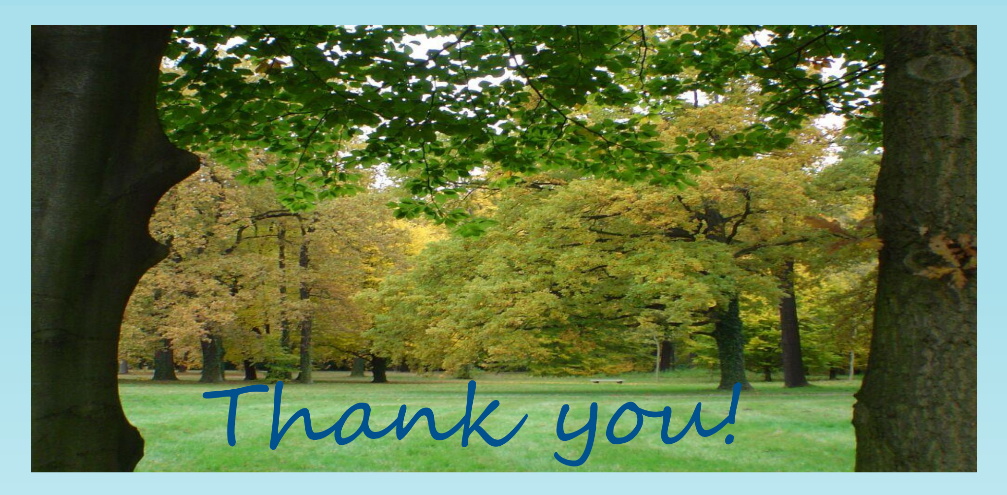
Image from <a href="http://old.saao.ac.za/~pah/Berlin%20Pictures/forest_1.jpg">http://old.saao.ac.za/~pah/Berlin%20Pictures/forest_1.jpg</a>