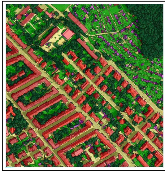
Figure 3. Classified image for a residential area in the City of Leipzig; see square in Fig. 2 for the zoomed-in location

3 not only presents the distinguished classes of trees, young trees and bushes, as well as lawn and meadows, but also the delineation of residential buildings in a central residential area.